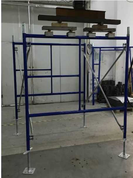
Sample 12-2 before test