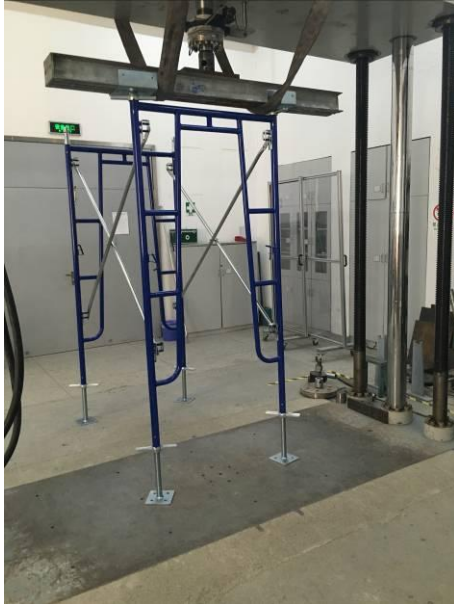
Sample 8-1 before test