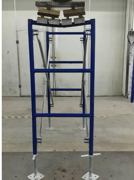
Sample 2-2 after test