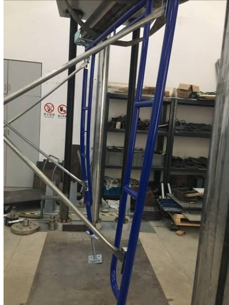
Sample 7-1 after test