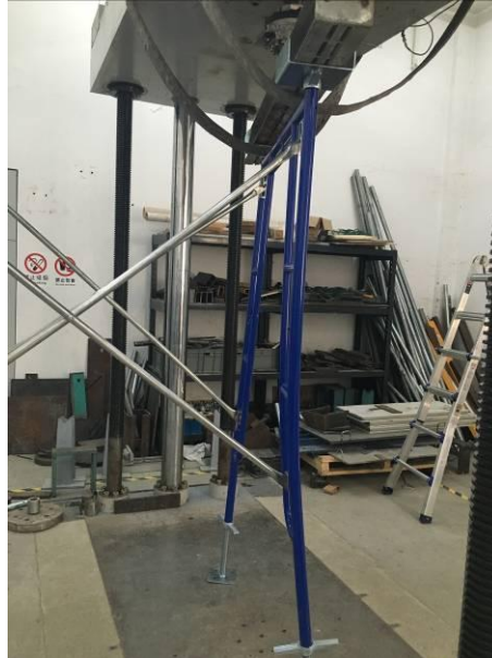
Sample 9-1 after test