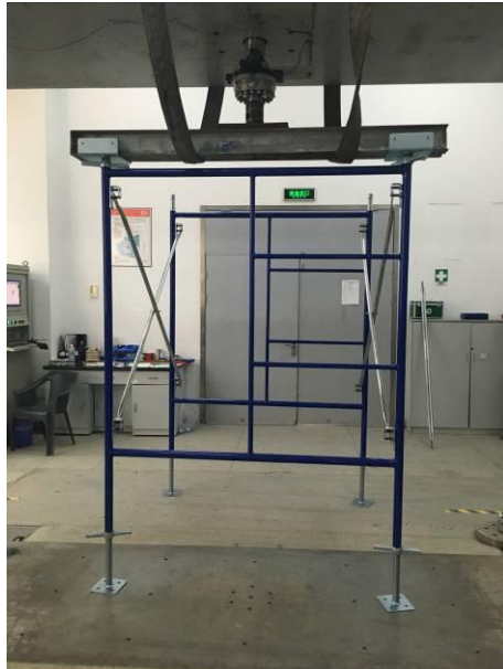
Sample 10-1 before test