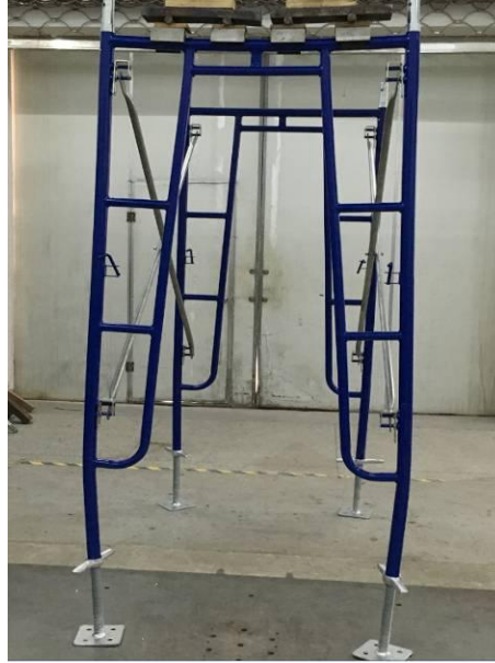
Sample 8-2 after test