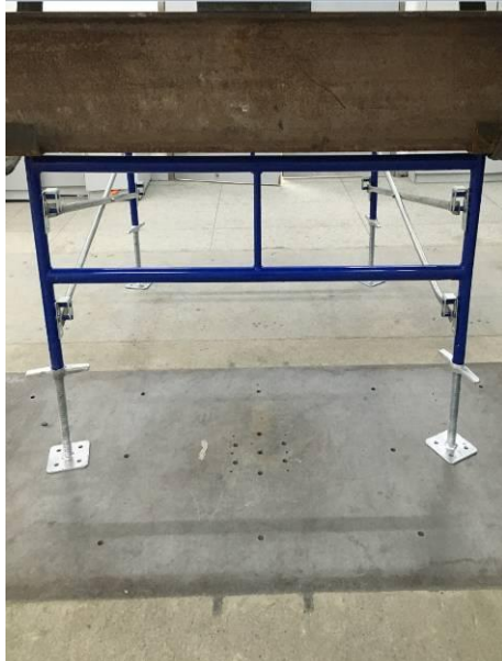
Sample 14-1 before test