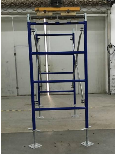
Sample 1-2 before test