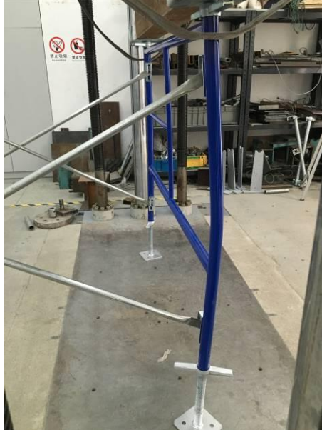
Sample 12-1 after test