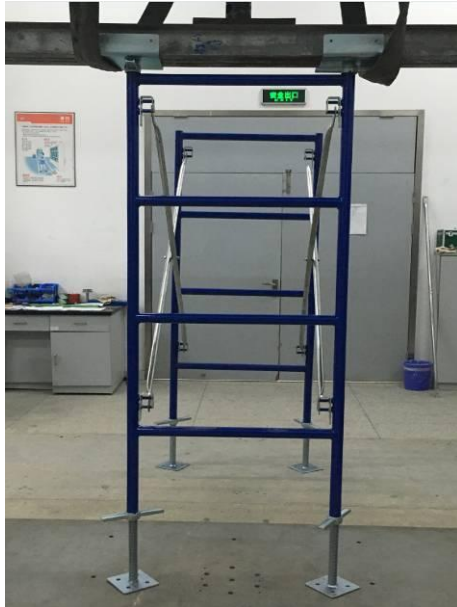
Sample 4-1 before test