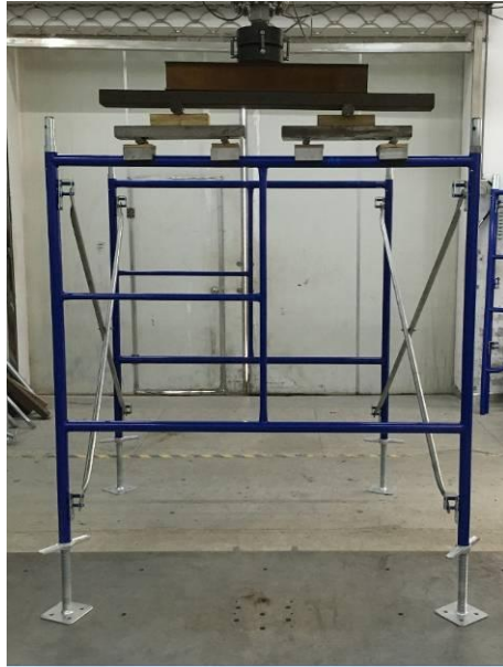
Sample 11-2 before test