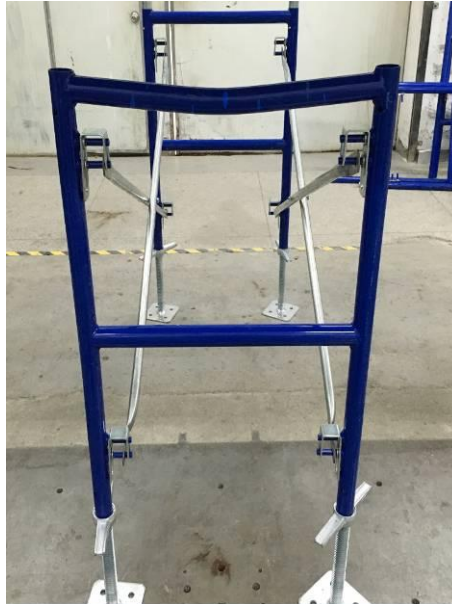
Sample 3-2 after test