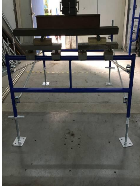
Sample 14-2 before test