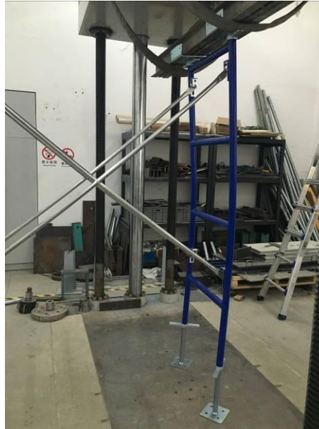
Sample 1-1 after test