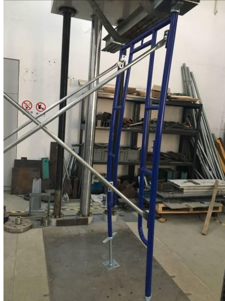
Sample 8-1 after test