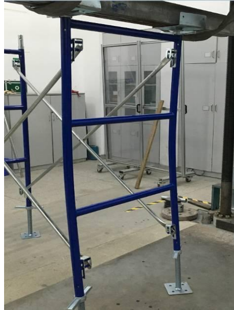
Sample 5-1 after test