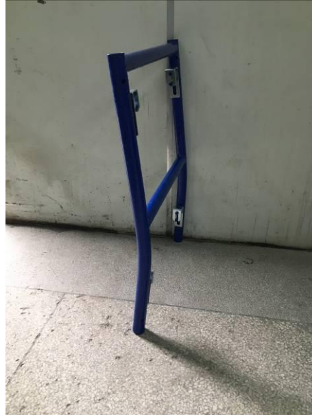
Sample 3-1 after test