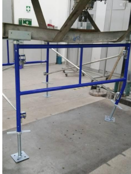
Sample 13-1 after test