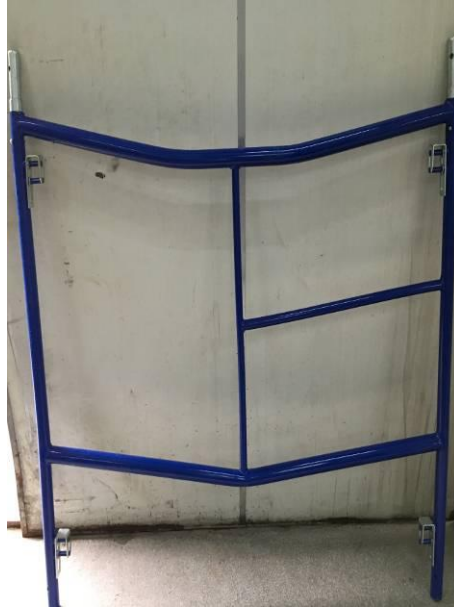
Sample 12-2 after test