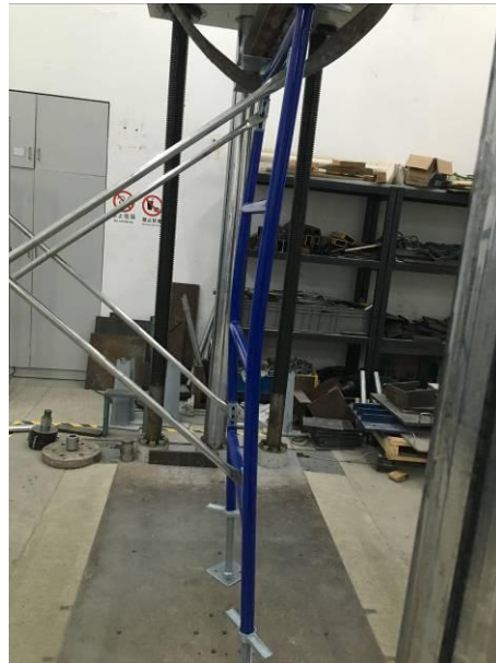
Sample 4-1 after test