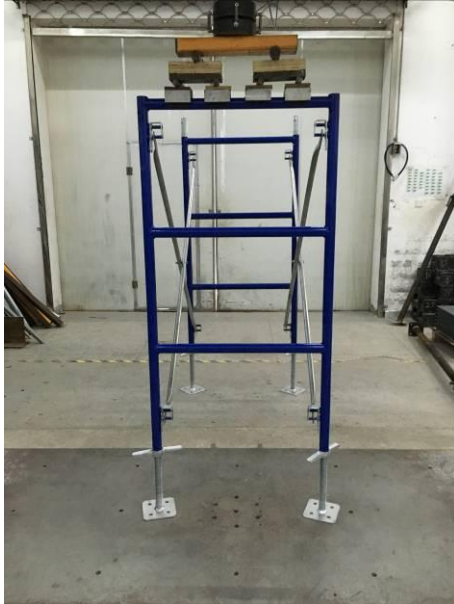
Sample 5-2 before test