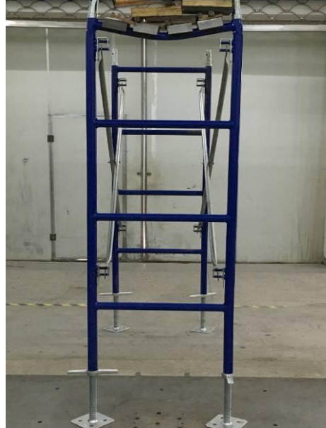
Sample 1-2 after test