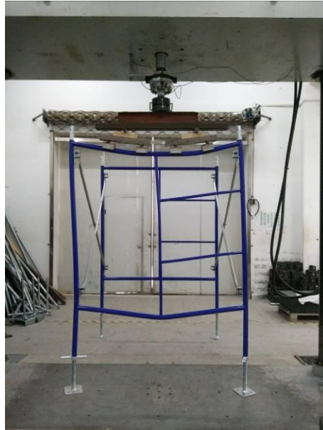
Sample 10-2 after test