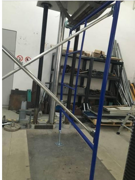
Sample 10-1 after test