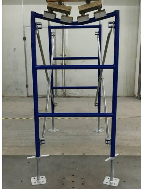
Sample 5-2 after test