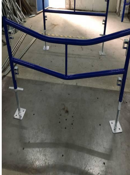
Sample 14-2 after test