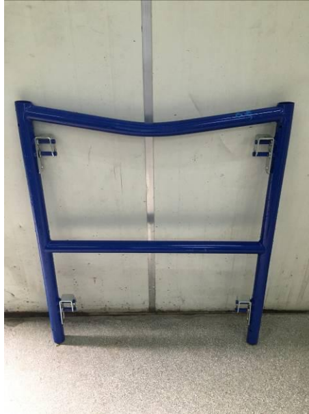
Sample 6-2 after test