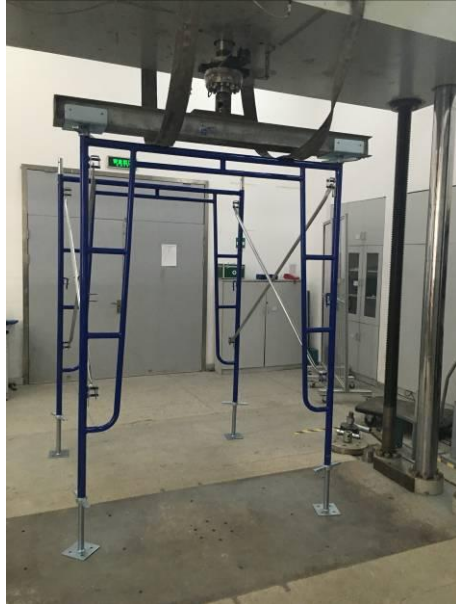
Sample7-1 before test