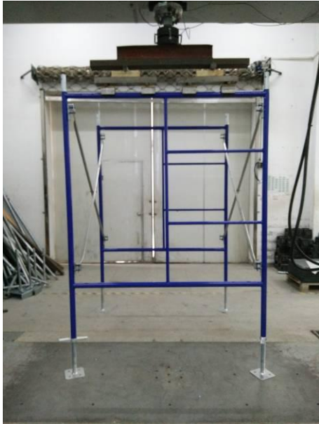
Sample 10-2 before test