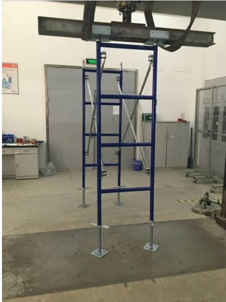
Sample 1-1 before test