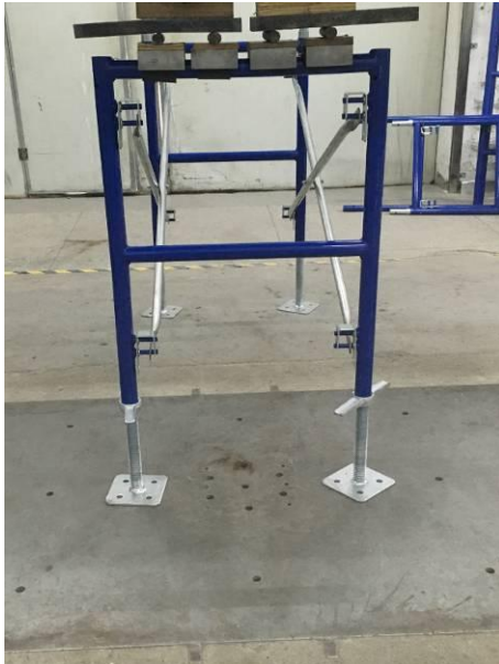
Sample 3-2 before test