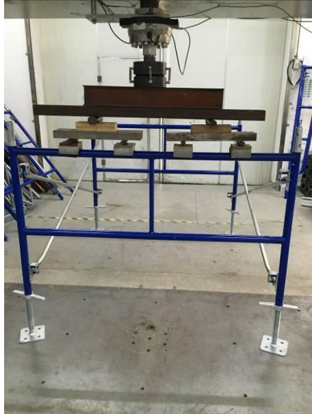
Sample 13-2 before test