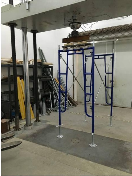
Sample 8-2 before test