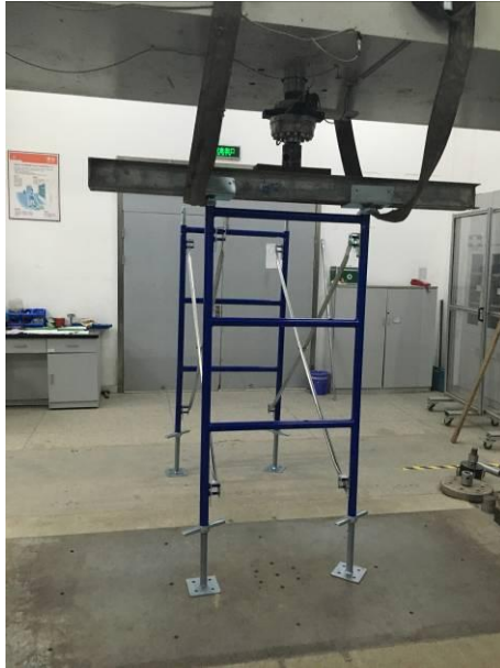
Sample 5-1 before test