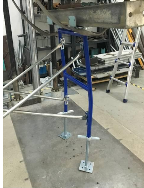
Sample 6-1 after test