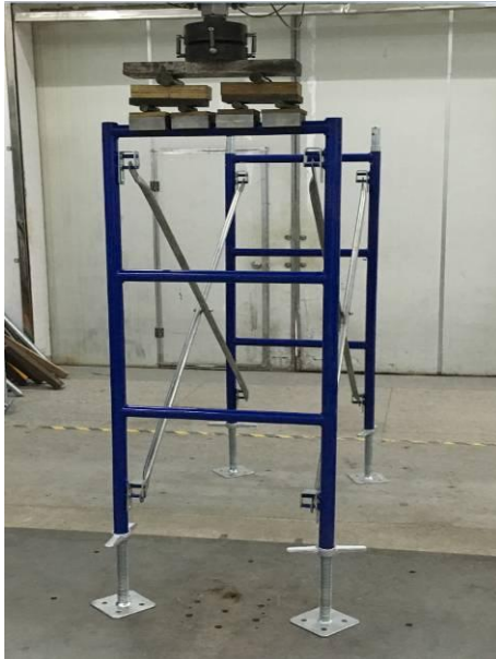
Sample 2-2 before test