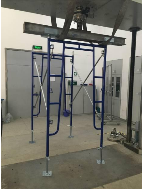
Sample 9-1 before test