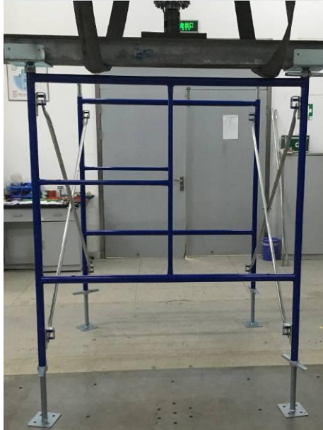
Sample 11-1 before test