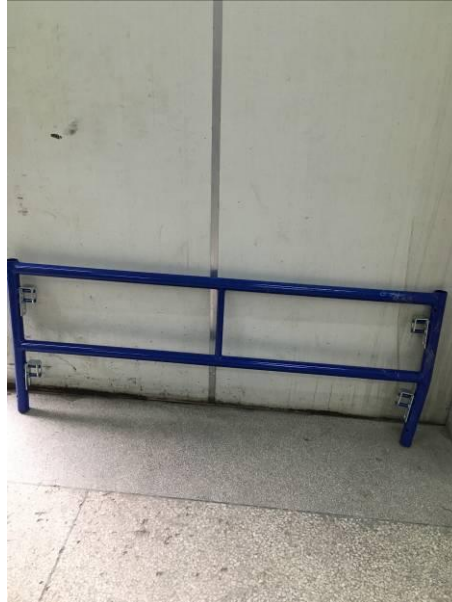
Sample 14-1 after test