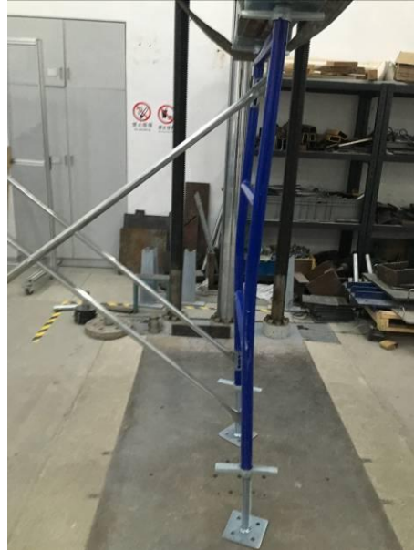
Sample 2-1 after test