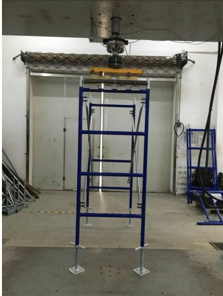
Sample 4-2 before test