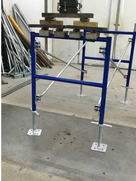
Sample 6-2 before test