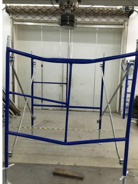
Sample 11-2 after test