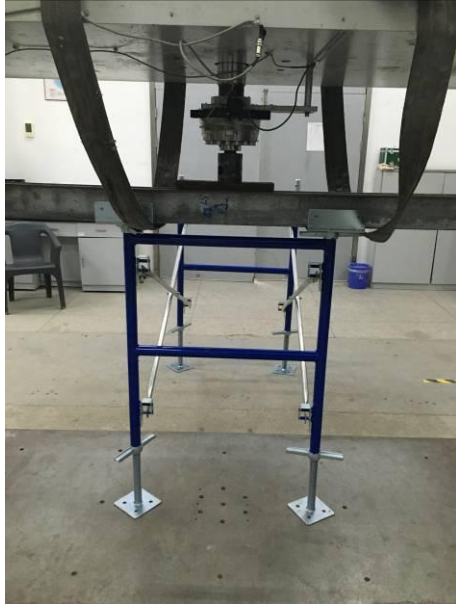
Sample 3-1 before test