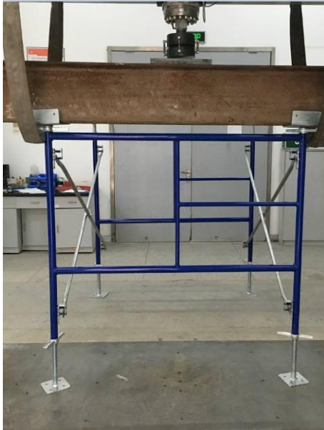
Sample 12-1 before test