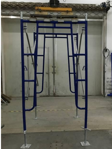
Sample 9-2 before test