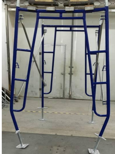
Sample 9-2 after test