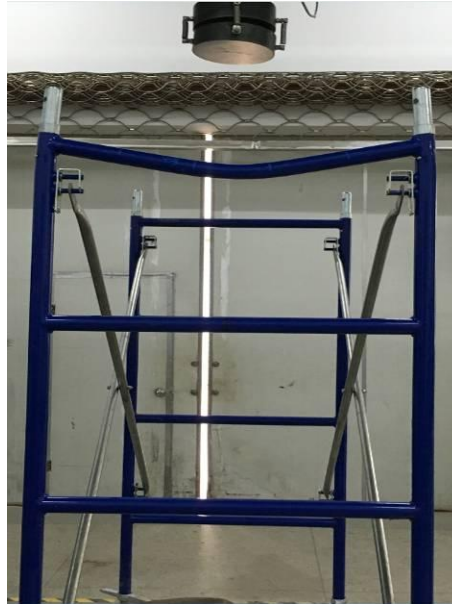
Sample 4-2 after test