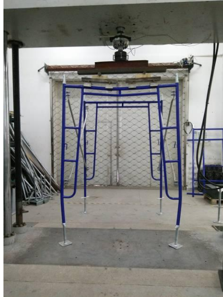
Sample 7-2 after test