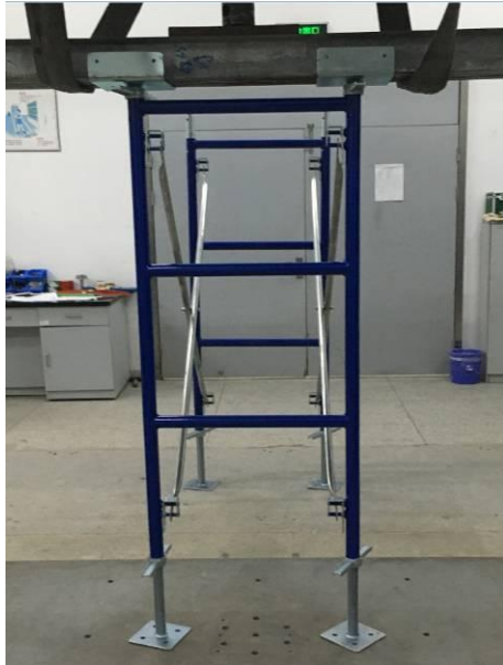
Sample 2-1 before test