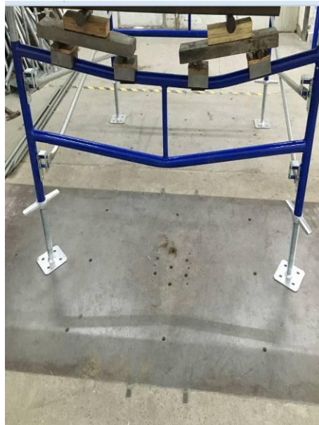
Sample 13-2 after test