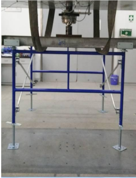
Sample 13-1 before test