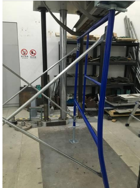
Sample 11-1 after test