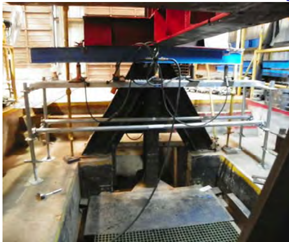
10' UDL setup